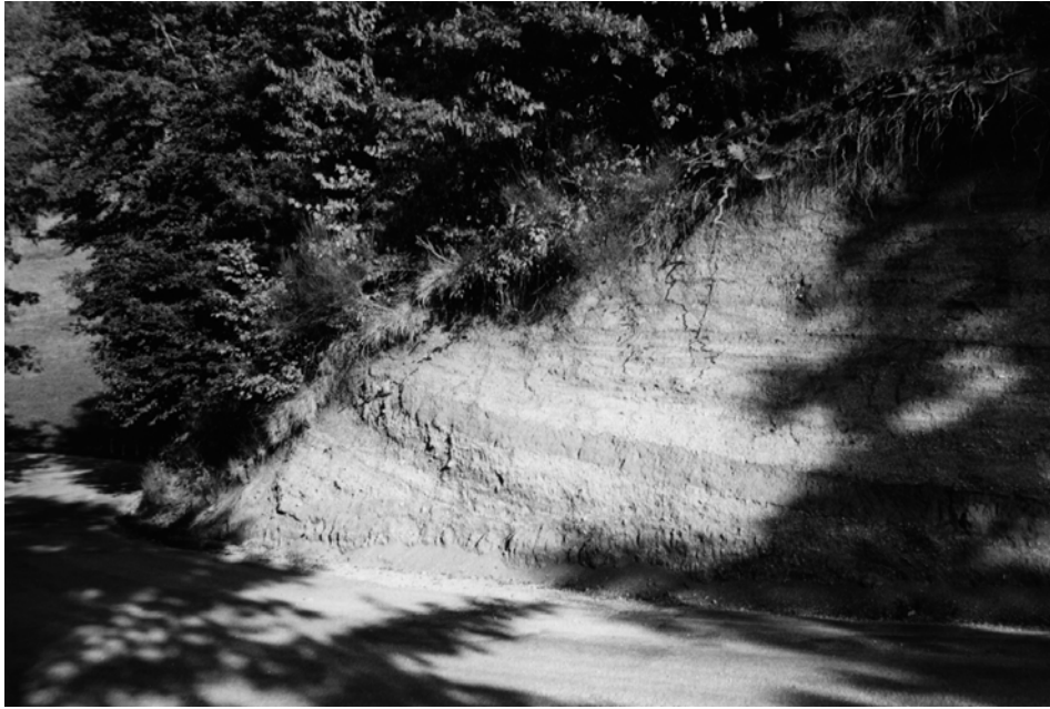
Figure 5: Recent terrestrial deposits, south of Cesi village.