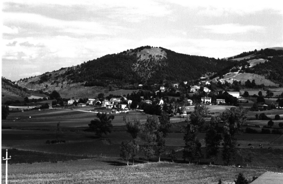
Figure 4: View of Cesi from the west.

The most representative example of intense differentiation was in Cesi village, which lies about seven kilometers south of Colfiorito (Figure 1), located on the earthquake epicenter. The village comprises about 300 residences and some public buildings founded at the foot of a small hill (Figure 4). The western part of the village occupies an almost flat expanse which corresponds to the outcrops of post-alpine formations and specifically to 10-20 meters thick terrestrial deposits consisting of coarser and finer, loose and semi-cohesive, red-brown colored clastic material. These overlie unconformably the alpine basement (Figure 5).