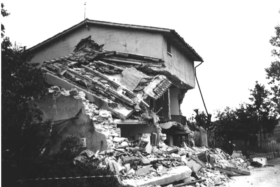
Figure 6: Damage and collapse in the west, low-lying flat part of Cesi.

The damage gradually decreased towards the eastern side of the village, built on the hilly part, where only partial collapses were noted.. The intensity for this part was I_{EMS92}=VII .