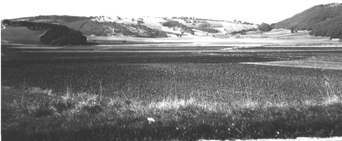
Figure 2: Pleistocene-Holocene deposits forming an almost plain relief and overlying unconformably the basement

Unconformably over the above-mentioned occurs a series of Late Pleistocene- Holocene clastic deposits. They outcrop in the low altitudes areas and intermontane valleys [Barberi et al., 1993, Boccaletti, et al., 1985, Calamita et al., 1986] (Figure 2).