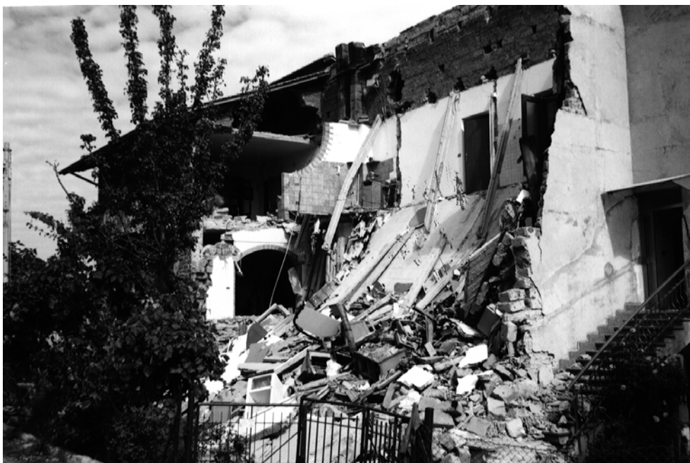
Figure 3: Construction partially collapse in the epicentral area.

The Umbria earthquake of 26th September 1997 induced extensive damage within an extended area in central Italy. Based on official reports, out of 32.865 private houses checked, 9.182 collapsed, were severely damaged or rendered inhabitable. According to official records, in about 20 villages and/or settlements, 25% of public buildings and 20% of schools were rendered demolishable, while 55% of churches received an important amount of damage (Figure 3).